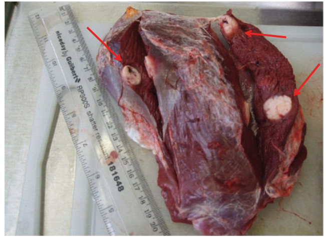
Figure 2. Three irregular intramuscular masses were found in the right superficial pectoral muscle varying in size from approximately 13–17 mm (arrows). These masses were firm on cross section and areas of haemorrhage were visible.

subcutaneous bruising of the lateral aspect of the right leg, caudal aspect of the tail and caudal aspect of the left stifle joint, suggestive of blunt trauma. On the lateral, medial and caudal aspect of the right stifle, there was a firm irregular mass incorporating the distal half of the femur. Additionally, there were several beige, well demarcated, irregular masses of approximately 10–30 mm diameter present in the soft tissues and musculature lateral to the stifle. The masses present on the lateral aspect were firm on cut surface with a bony appearance; those present on the medial aspect were less firm and had haemorrhagic centres. A cross section through the distal femur mass revealed a uniformly bony cut surface with loss of the normal cortical architecture and medullary cavity.