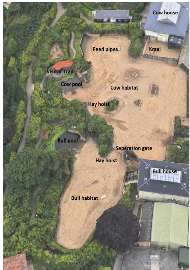
Figure 1. The Kaziranga Forest Trail habitat for elephants at Dublin Zoo, showing indoor houses, outside kraal and locations of feed stations (hay hoists and pipes).